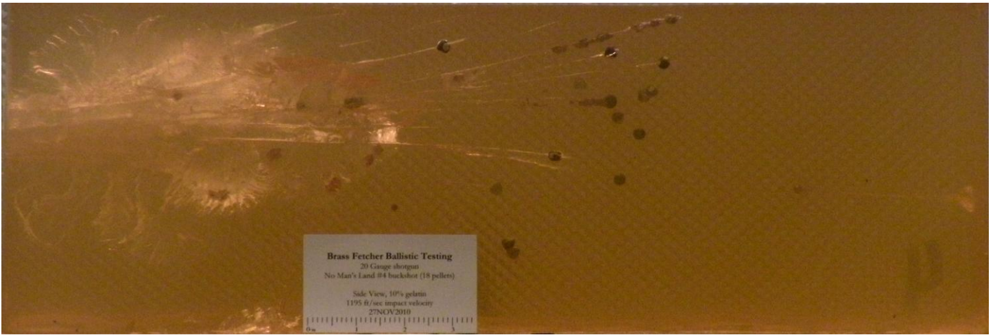
Figure 2. Side view of Shot 1 gelatin block